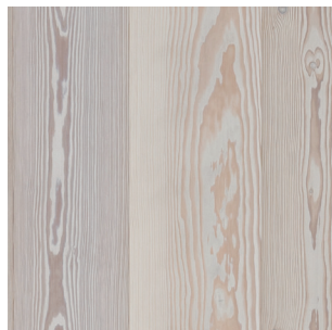
Douglas Cathedral light