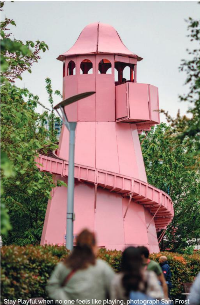
Stay Playful when no one feels like playing