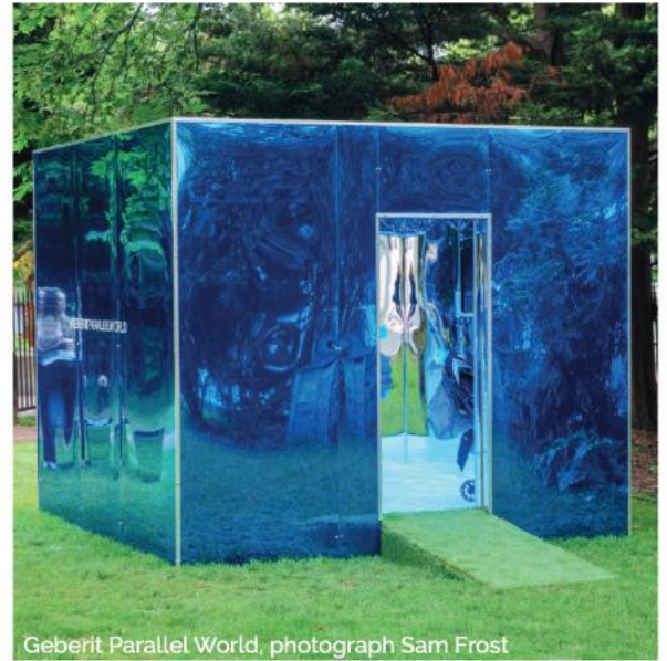
Geberit Parallel World